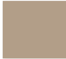
C-16 Winter Beige