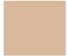
C-135 Summer Beige