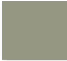
C-31 Shadow Slate*

Concrete color is altered by many factors, including cement and aggregate color, slump, finishing practices, and curing method. Using the contemplated materials and construction techniques, representative samples should be cast for approval, especially when exact color matching is important.