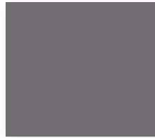
C-284 Landmarks Gray