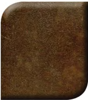
CS-14 Dark Walnut