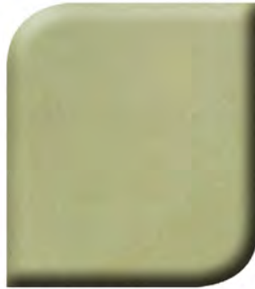
CS-11 Fern Green*