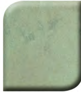
CS-13 Copper Patina*