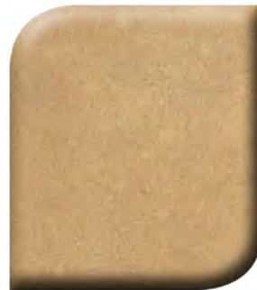
CS-15 Antique Amber