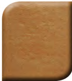
CS-16 Faded Terracotta