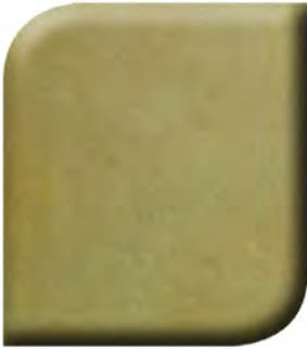
CS-12 Weathered Bronze*