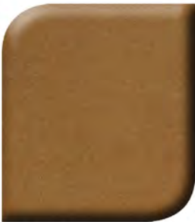
CS-2 Padre Brown